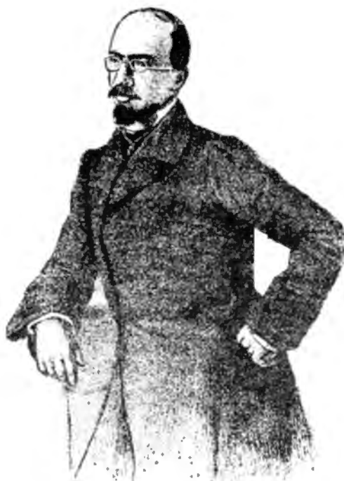
Figura 2. Mihail Kogălniceanu during the years of his youth 26 .

Being disturbed by certain abuses coming from the Moldavian reigning Prince Mihail Sturdza (1834-1848) 27 , Mihail Kogălniceanu decided to leave Moldavia, settling himself in Paris, in France. Before this voyage, he sold his personal library to Academia Mihăileană of Iași, and with the money obtained from the sale he set out on his way to the capital of France, where he arrived at the end of the year 1845. During the autumn of the next year, 1846, Mihail Kogălniceanu found out from the relations of the French press about an event that was going to happen in Madrid: the marriage of Queen Isabella II of Spain (1833-1868) to the Duke of Cadiz and of her sister (Infanta of Castile), to the Duke of Montpensier 28 . Thus, the ceremonies presented by the Parisian newspapers but also an older desire gave Kogălniceanu as well the impulse of going to Spain 29 .